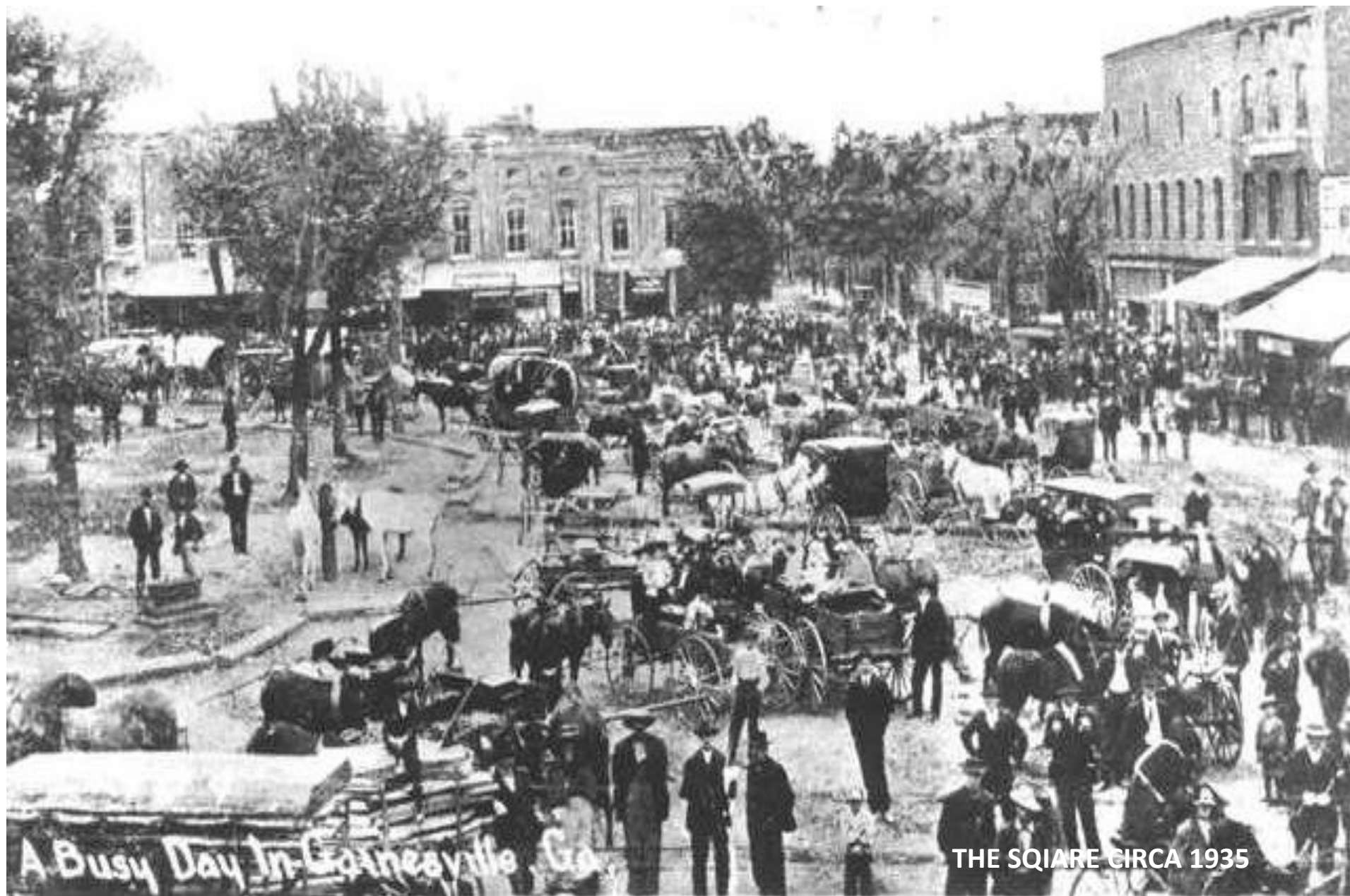
A Busy Day In Gainesville, Ga.